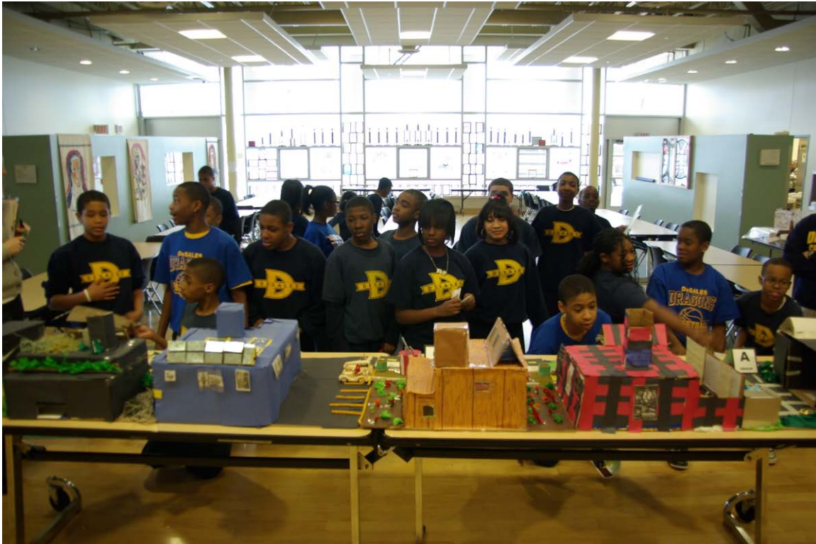
St. Francis deSales students check out all the Architecture By Children projects developed for this year's competition.